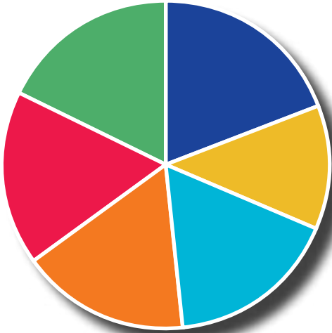
Years of Industry Experience